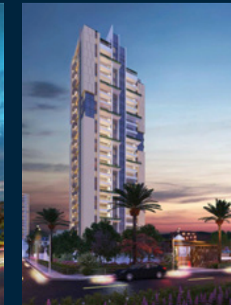
ALTITUDE 16 Elgin Road