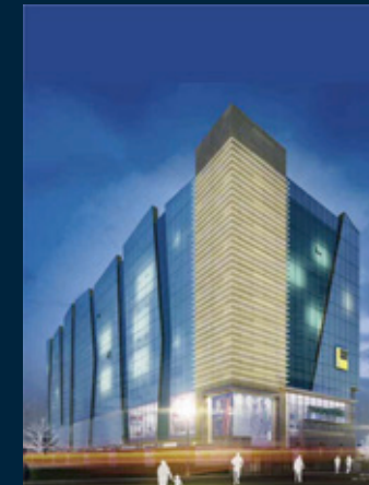
PRASAD SQUARE AJC Bose Road