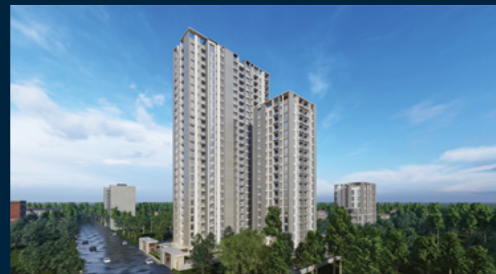
Residential building at Diamond Harbour Road.

KOLKATA WAS ONCE THE CAPITAL OF INDIA, THE SECOND MOST IMPORTANT METROPOLIS IN THE BRITISH EMPIRE AFTER LONDON. IT WAS ONCE A GOLD-STANDARD IN BUSINESS AND COMMERCE. IN THE MODERN CONTEXT OUR BRAND NEW COMMERCIAL PROJECT PLATINA IS ALL SET TO REDEFINE THE COMMERCIAL SPACE OF KOLKATA WITH THE PLATINUM STANDARD.