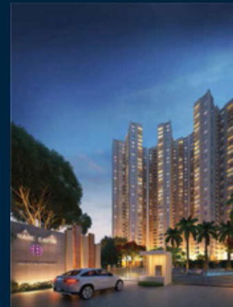
Rare Earth Near Swabhumi